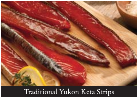
Traditional Yukon Keta Strips