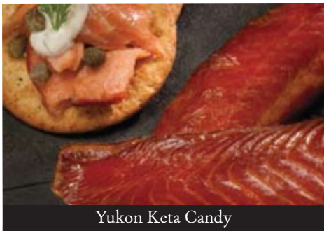
Yukon Keta Candy

Traditional Yukon Keta Strips are processed in much the same way that Yupik families have been preserving their catch for thousands of years. Cold smoked and dried, these are a great snack or can be thinly sliced for a delicious hors d'oeuvre.